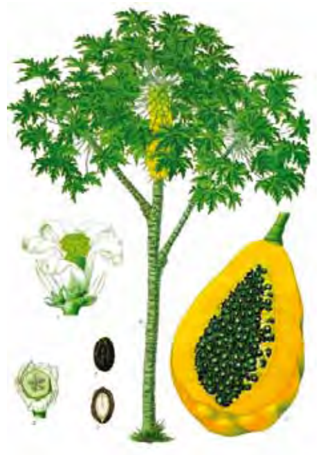
Pawpaw tree and fruit, from Koehler's Medicinal plants

Pot or bag sowing: The substrate consisting of tilled clay and sand soil mixed with compost should be placed into the pots or Polyethylene bags around 2 weeks before sowing. Sow 2-3 seeds per pot.