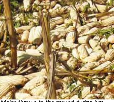
Maize thrown to the ground during harvesting can be easily contaminated.

- The cobs should be properly dried moisture. Dry again and 48 hours after harvest; always use a until no salt sticks on the tent on a completely dry ground (clean can then store the grains.