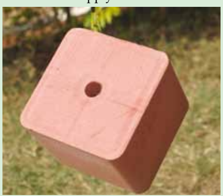
Buy good quality mineral licks

It is also good to know that especially growing animals and lactating cows need high amounts of additional calcium and phosphorous, but also other minerals for healthy growth and development, good digestion and milk production, disease resistance and a long life. Ordinary salt is therefore not sufficient, and a mineral salt or mineral feeds should be given regularly. Feed leguminous plants and other plants other than grasses to backup calcium and mineral supply.